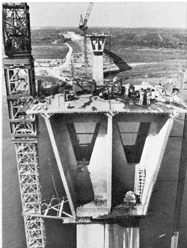
Fig. 2 Construction. Cross section at pier

The bridge is constructed in an area that has experienced as much as 2.8 m of subsidence over the past 75 years. While the rate of subsidence has decreased, it is expected that the bridge will experience 230 mm of subsidence during its life, 90 mm of which will occur during construction.