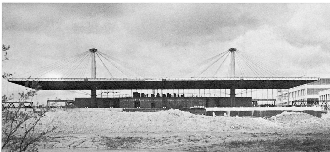
Fig. 2 Roof under construction showing cable system

A column-free space was the main requirement for Baxter Laboratories Dining Hall. The cable-supported roof system was selected due to its structural efficiency and unique architectural features. The system provides large column-free space and open perimeter where light window wall could be installed. Symmetric location of mast and use of natural load-flow mechanism through tension in cable limited the stress resulting in a highly efficient and a very light roofing system. The 48-1.375 in. dia. tension cables suspended from each mast support the roof deck at each node of the roof's 24 ft. framing grid (Fig. 3). The roof deck acts as compression chord and carries self-load between the nodes spaced 24 ft. on centers. The roof system is stiffened by 24-3/4 in. dia. lower cables which hold down the roof grid on its underside. This cable system acts as a stabilizer for the vertical dynamic oscillations under wind forces which induce uplift in the roof system. Another 36 lower cables run vertically at 24 ft. intervals around the building perimeter. The function of these cables is to minimize the framing edge vertical deflections under wind or unequal snow loads, and thus permit a practical window wall detail at this interface. These cables are attached to top of perimeter nodes of the roof frame and at the bottom to the building foundation. The perimeter cables are concealed in every fourth mullion of the curtain wall.