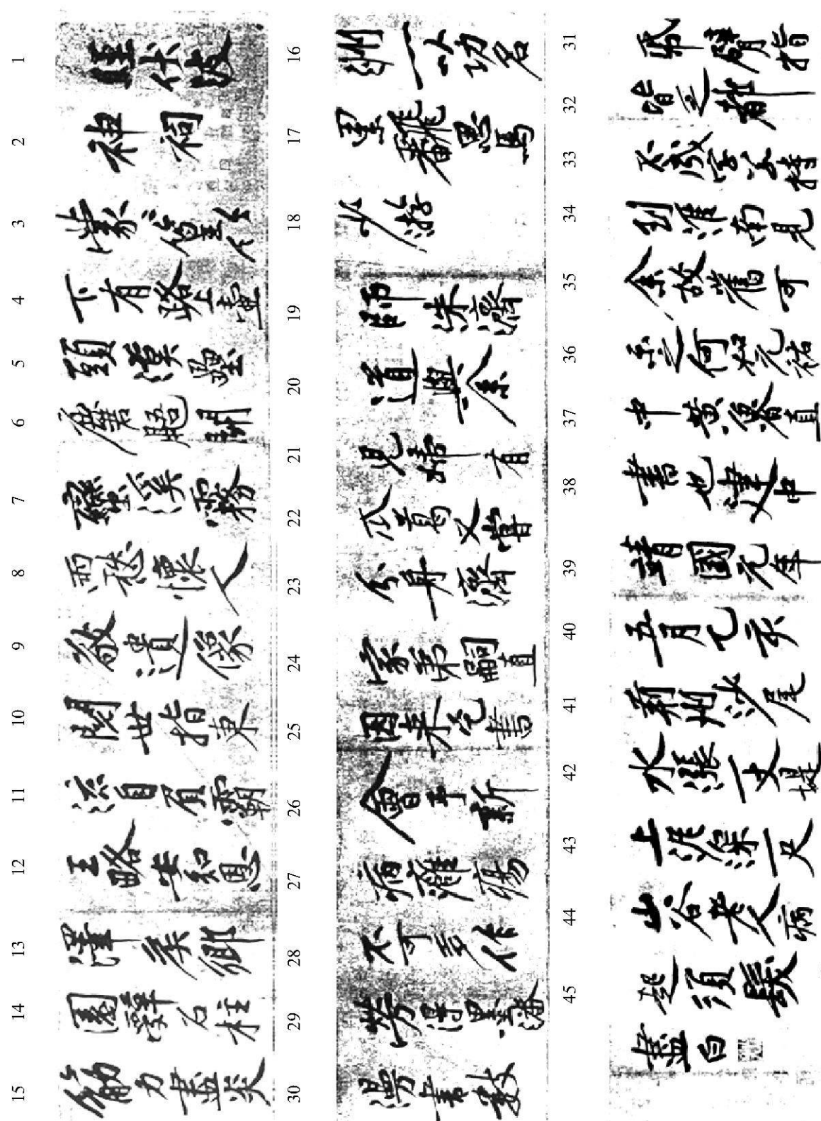
Illustration 1: Huang Tingjian. Passing the Shrine of the God Calming the Waves . Dated 1101. Handscroll, ink on paper (33.6 x 820.6 cm). Hosokawa Collection / Eisei Bunko Museum, Tokyo, Japan.