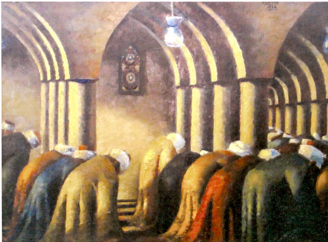
Figure 2: Mahmoud Saïd, Prayer , oil on plywood, 58 × 79 cm, 1934.

expressed his profound admiration for the Italian Primitives as well as the influence of the Venetian Renaissance on his paintings (Figure 2). 28