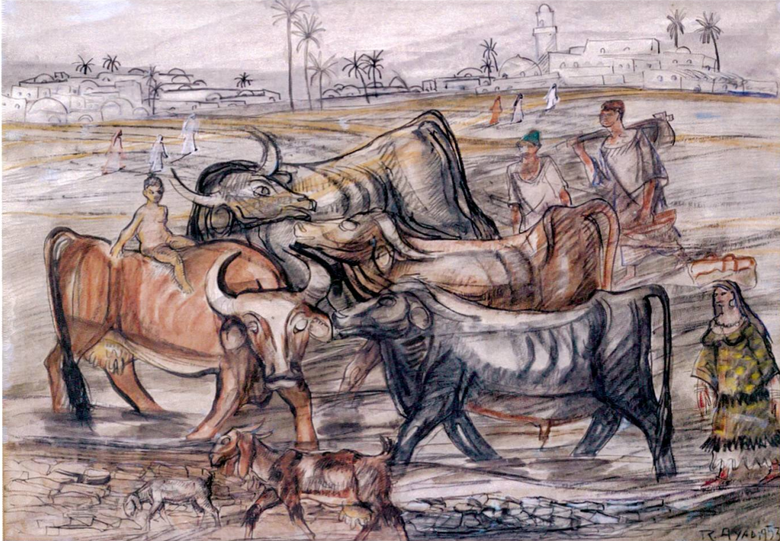
Figure 5: Ragheb Ayad, The Field , ink and watercolour on paper, 1954.

his depictions of the peasants' daily lives (Figure 5). 37 All of them however remained connected to Italy throughout their career and would regularly return to their host country.